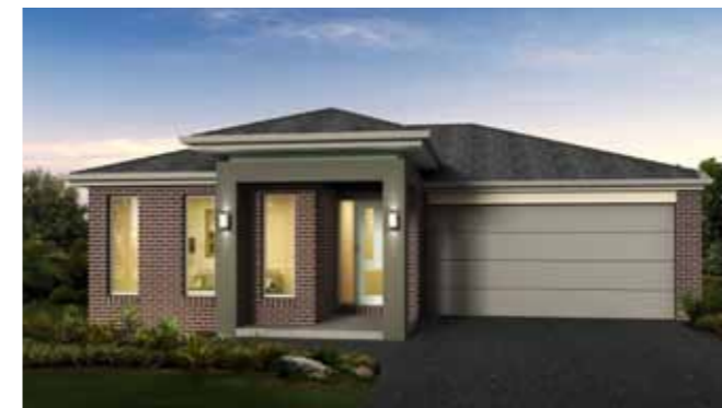
Avante Resort Lot 2308 Saltbush Cct 3 2 1