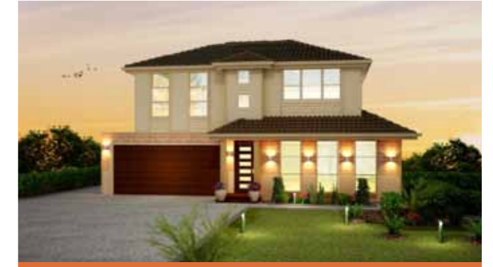
Lot 182 Bluebell Crescent 4 2 2