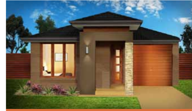
Bella Carina Lot 3313 Finsbury Cct 3 1 1