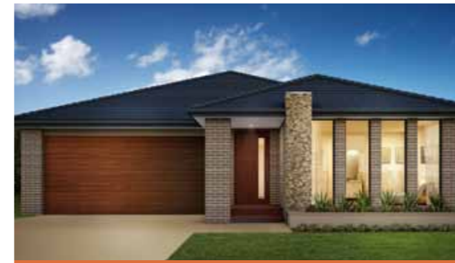
Combewood Blaxland Lot 2232 Lawler St 3 2 2