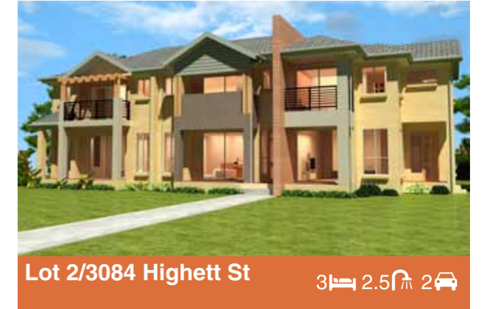
Lot 2/3084 Highett St 3 2.5 2