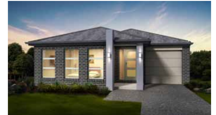
Avante Boulevard Lot 3316 Finsbury Cct 3 2 1