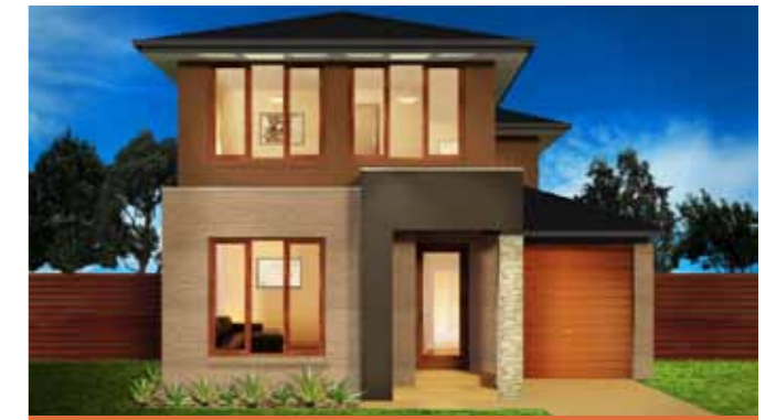
Scala Supra Lot 2202 Stringybark Rd 4 2.5 1