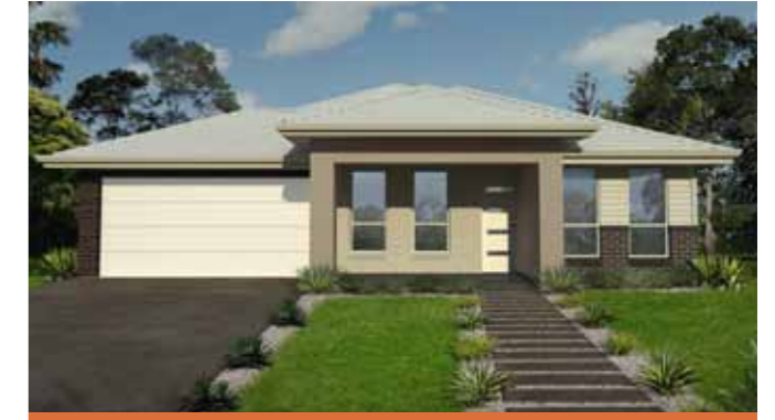
Lot 5 Townsend Crescent 4 2 2