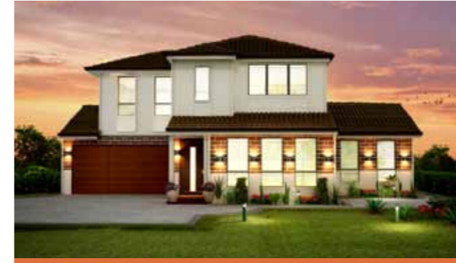
Lot 71 Gilroy Street 4 2.5 2