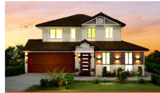
Lot 542 Minyip St 4 2.5 2