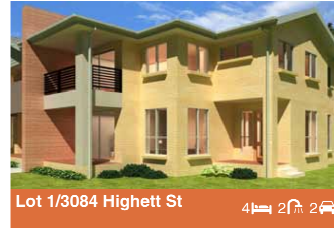
Lot 1/3084 Highett St 4 2 2