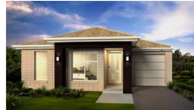
Avante Allure Lot 3310 Finsbury Cct 3 2 1