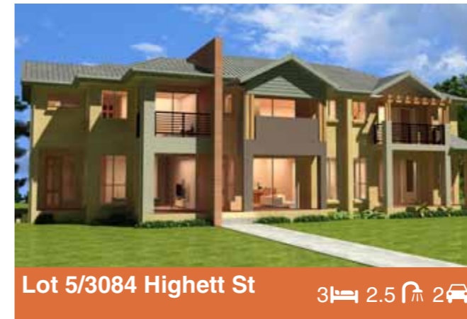
Lot 5/3084 Highett St 3 2.5 2