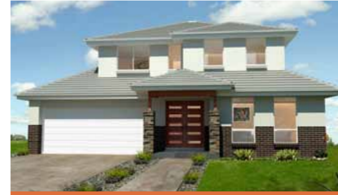
Lot 120 Raffan Street 4 2.5 2