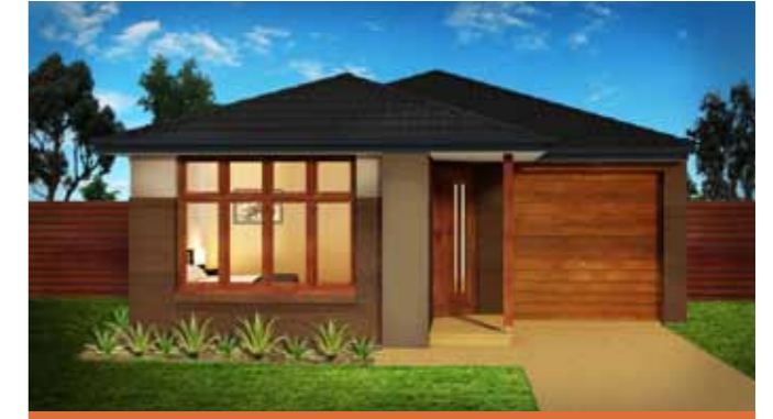
Bella Broadway Lot 2222 Stringybark Rd 3 1 1