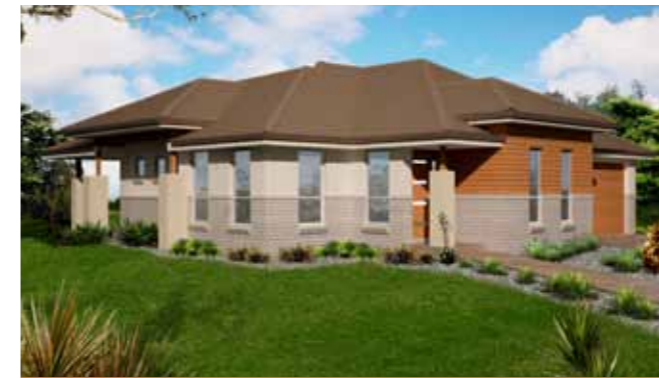
Lot 3 Townsend Crescent 4 2 2