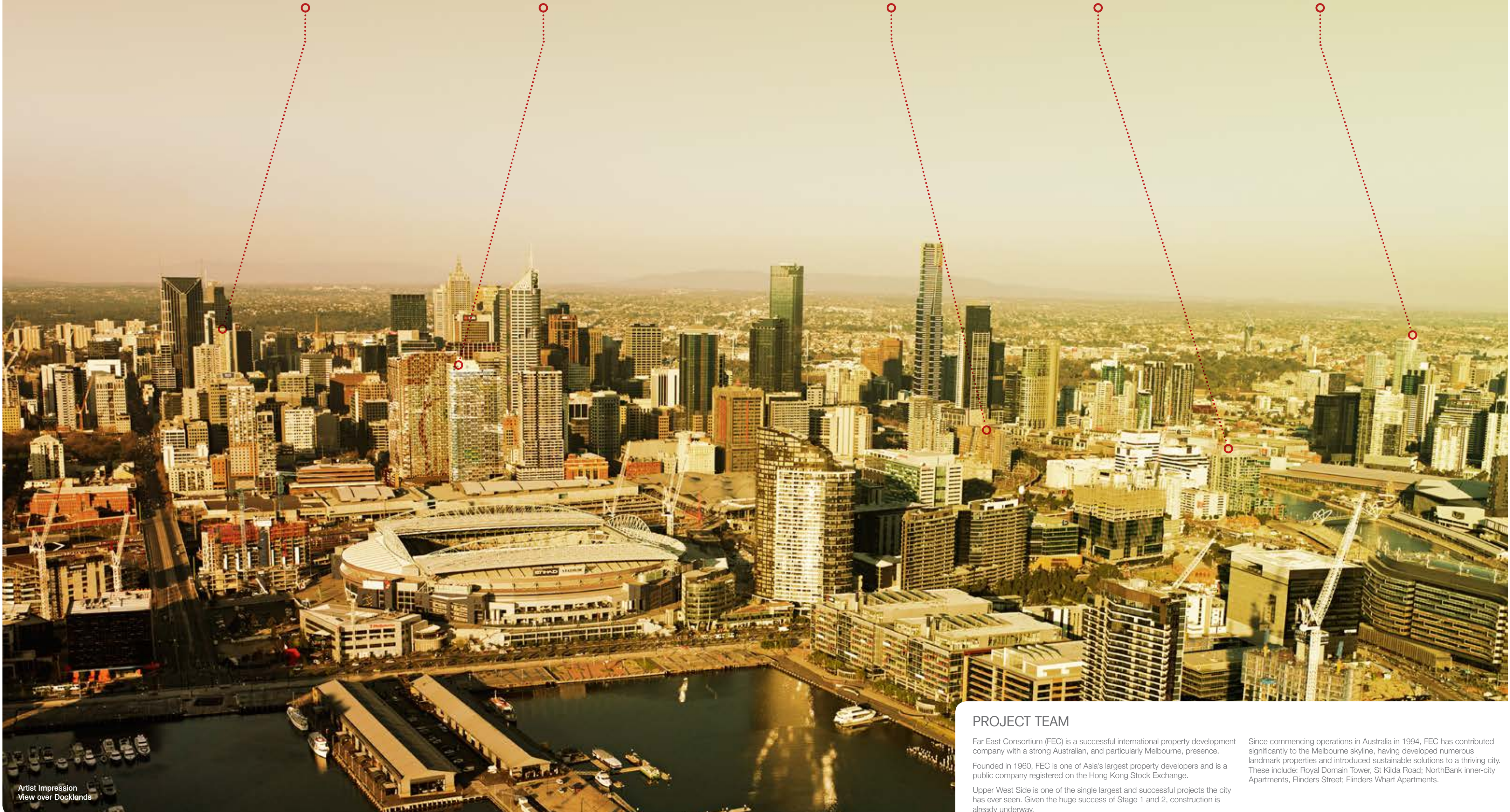
Artist Impression View over Docklands