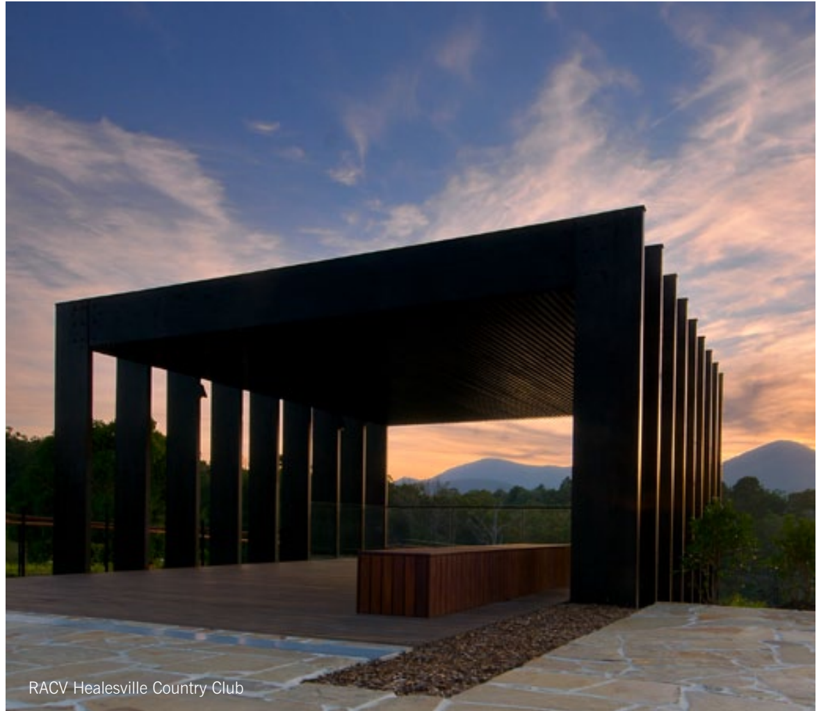
RACV Healesville Country Club