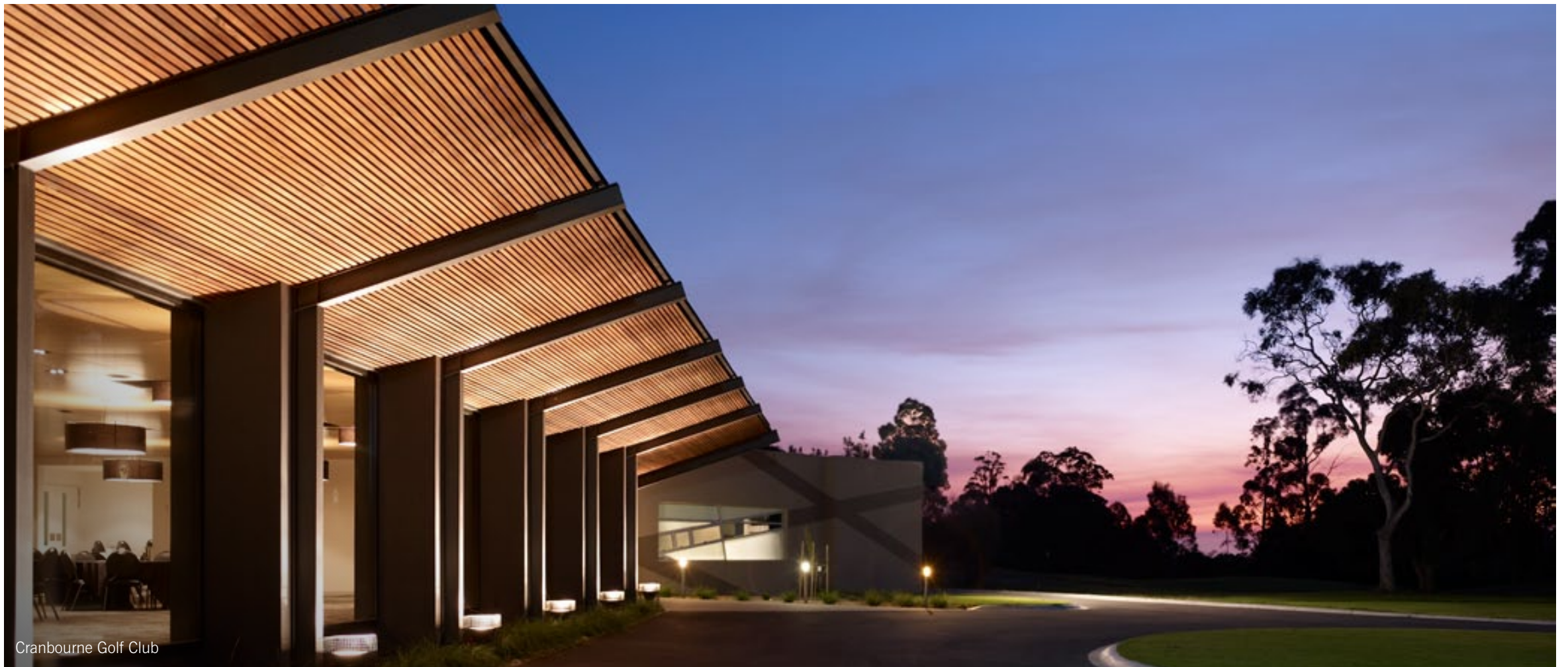
Cranbourne Golf Club