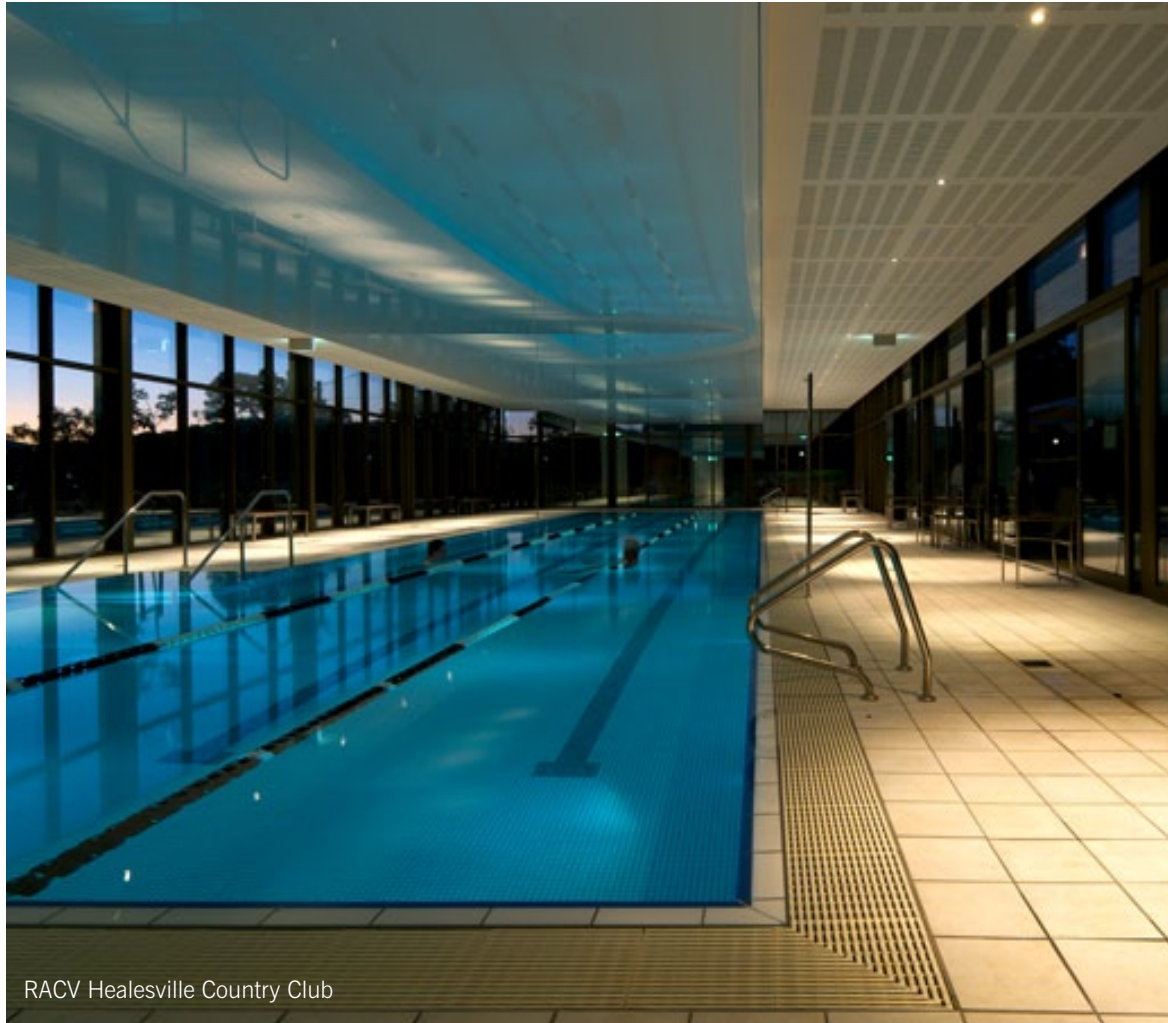
RACV Healesville Country Club