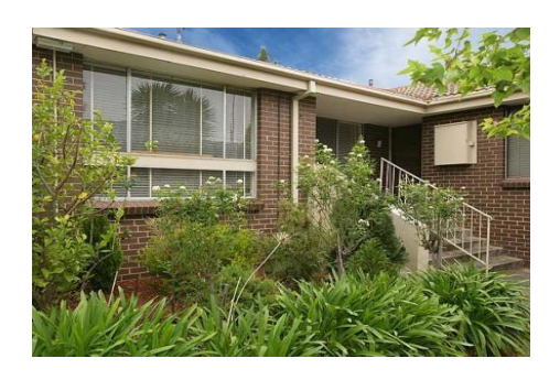
2/78 Rose Street, Brunswick 3056 (VG) 2 Bed 1 Bath 1 Car Price: $630,000 Method: Sale Date: 11/04/2019 Property Type: Flat/Unit/Apartment (Res) Agent Comments: Brick villa unit with superior private courtyard and covered deck area.