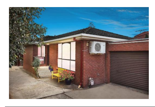
2/1 Coronation Street, Brunswick West 3055 (REI) 2 Bed 1 Bath 1 Car Price: $581,000 Method: Auction Sale Date: 6/07/2019 Property Type: Unit Agent Comments: Brick villa unit with similar accommodation.