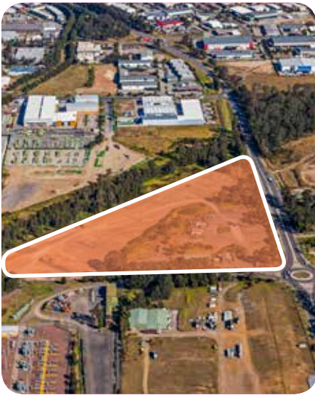
M1 BUSINESS PARK

The M1 Business Park is situated approximately 20 kilometres North West of the Newcastle CBD within the Beresfield industrial precinct. The M1 Business Park has exposure to Weakleys Drive and convenient access to the M1 Motorway.