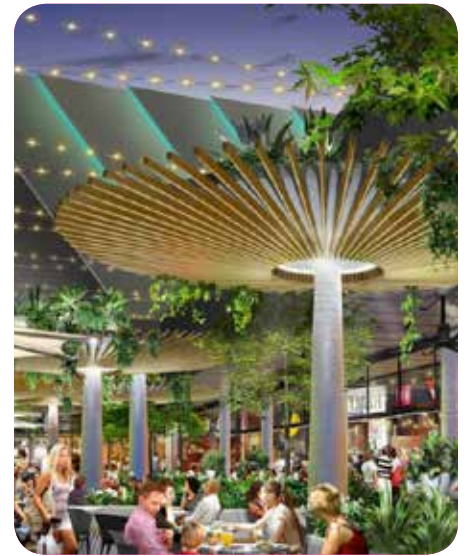
GREENHILLS SHOPPING CENTRE

M1 Business Park is also central to the surrounding Hunter region. This includes the growth areas of Port Stephens, Lake Macquarie, Greenhills and Maitland. The Park is 25 minutes from Newcastle CBD and the Port of Newcastle and 20 minutes from Newcastle Airport, with direct flights to Sydney, Melbourne and Brisbane.