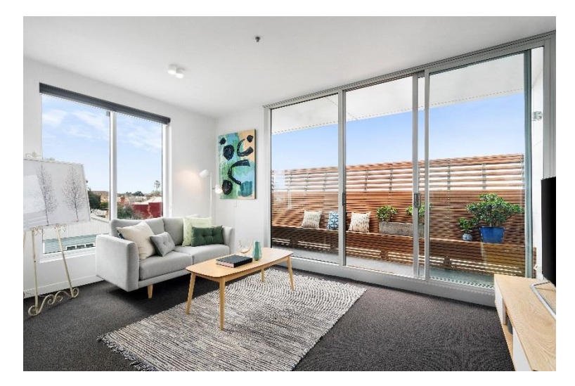
1 Bed 1 Bath 1 Car Property Type: Apartment Indicative Selling Price $399,000 Median Unit Price Year ending June: $605,000