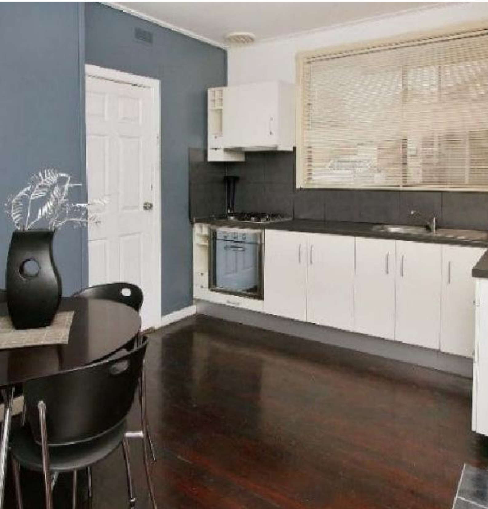
1/1 EVANS CRESCENT, RESERVOIR, VIC 3073 PREPARED BY MITCH HUNG NGUYEN, PROFESSIONALS ST ALBANS