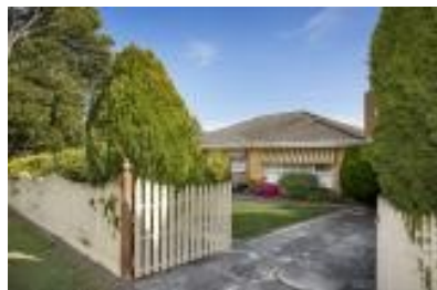
150 Graham Rd VIEWBANK 3084 (REI)

Price: $852,000 Method: Private Sale Date: 17/09/2018 Rooms: 6 Property Type: House Land Size: 534 sqm approx