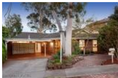
15 Rodney Ct VIEWBANK 3084 (REI)