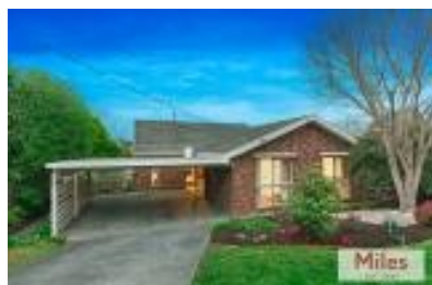
21 Fran Cr VIEWBANK 3084 (REI)

Price: $865,500 Method: Auction Sale Date: 13/10/2018 Rooms: 6 Property Type: House (Res) Land Size: 619 sqm approx