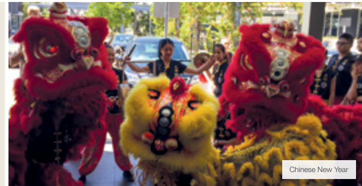
Chinese New Year