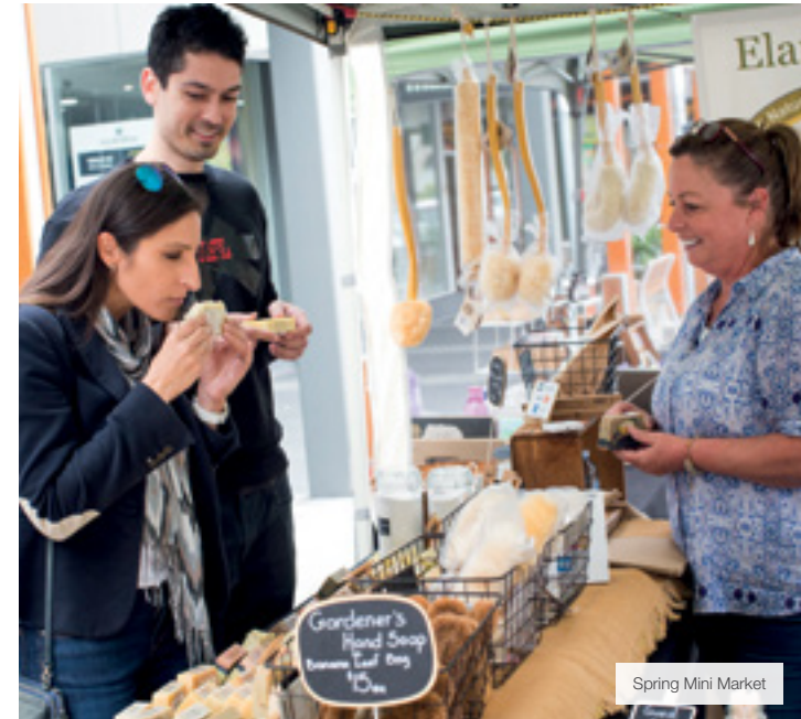
Spring Mini Market

The introduction of numerous residential apartment complexes within walking distance to the centre provides a growing captive market as well as revitalisation of the area.