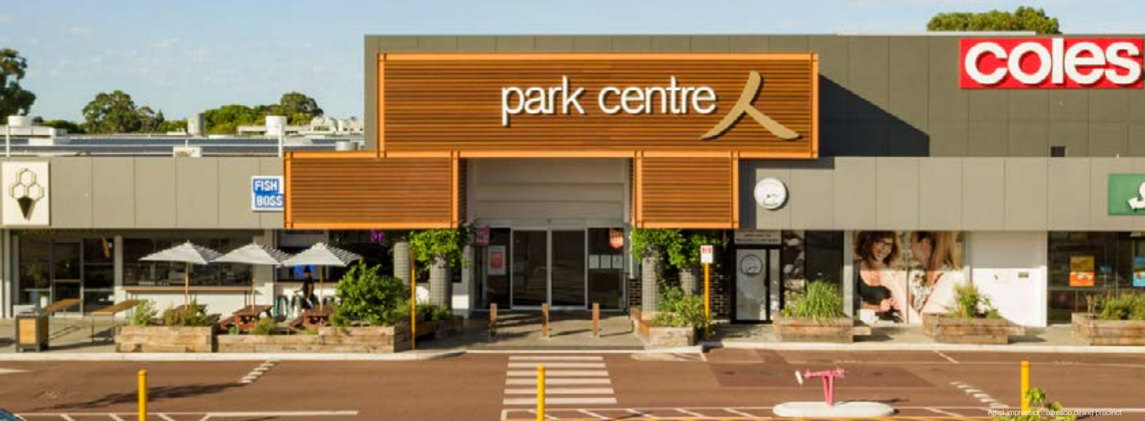
Artist impression: alfresco dining precinct

Hawaiian is a privately-owned Western Australian property group with an evolving portfolio across the commercial, retail, hospitality and land development markets.