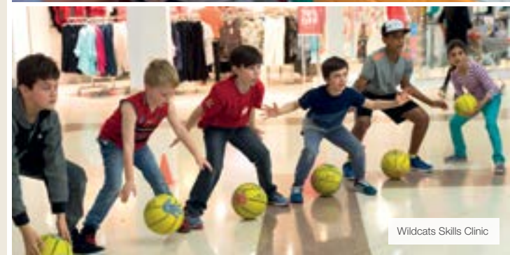
Wildcats Skills Clinic