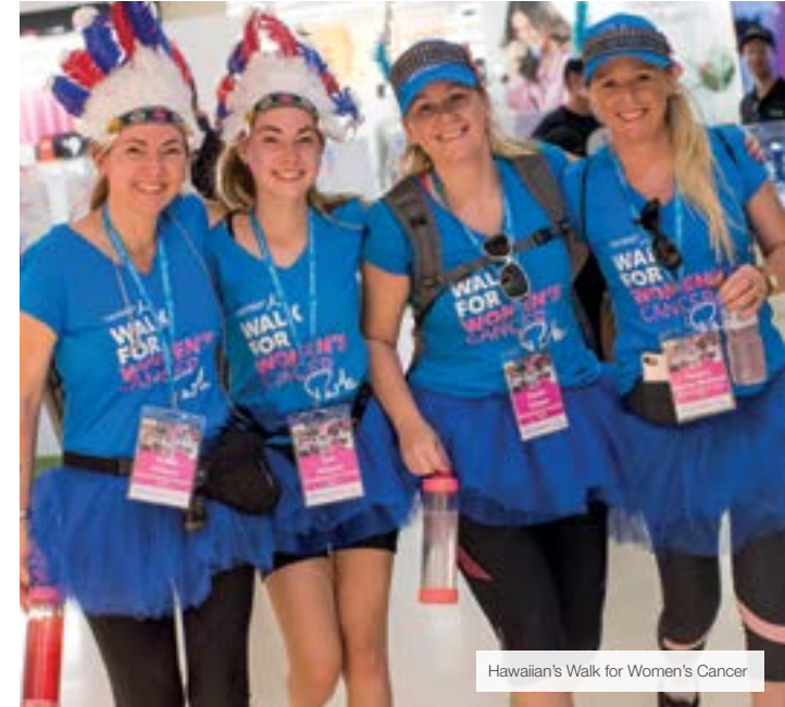
Hawaiian's Walk for Women's Cancer

In alignment with Hawaiian's commitment to building community spaces, Hawaiian's Park Centre has recently undergone an aesthetic rejuvenation including new internal and external painting, lighting, entry statements and an alfresco dining precinct. Resurfacing of the car park and new landscaping has also significantly enhanced our shoppers' experience.