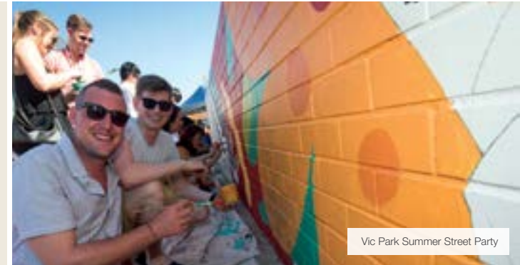
Vic Park Summer Street Party

1 Classified in accordance with SCCA guidelines. 2 Number subject to refurbishment of car park.