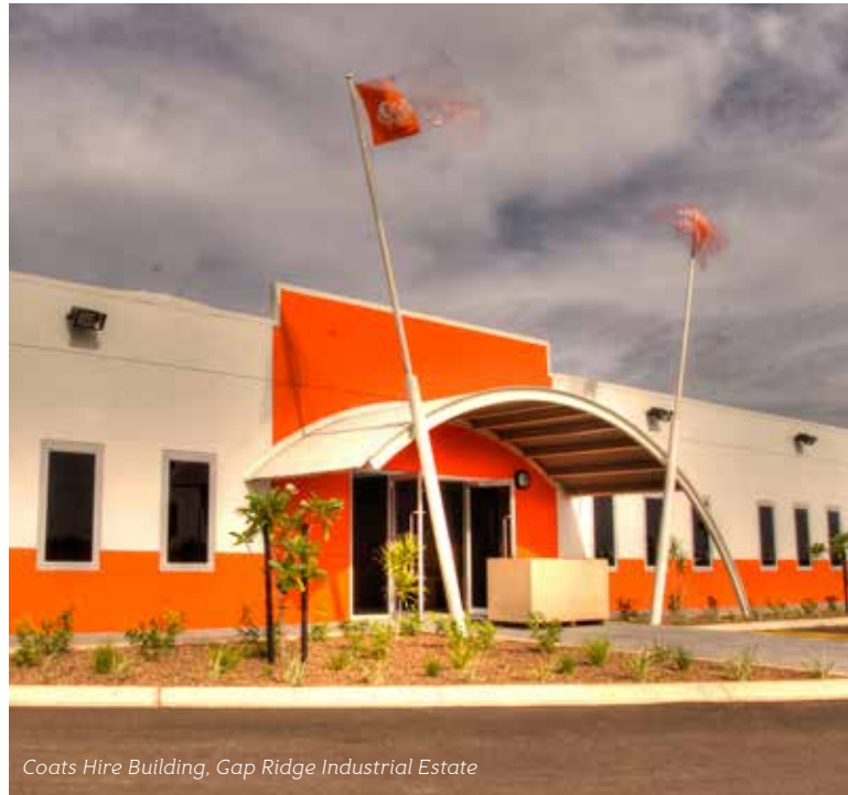
Coats Hire Building, Gap Ridge Industrial Estate